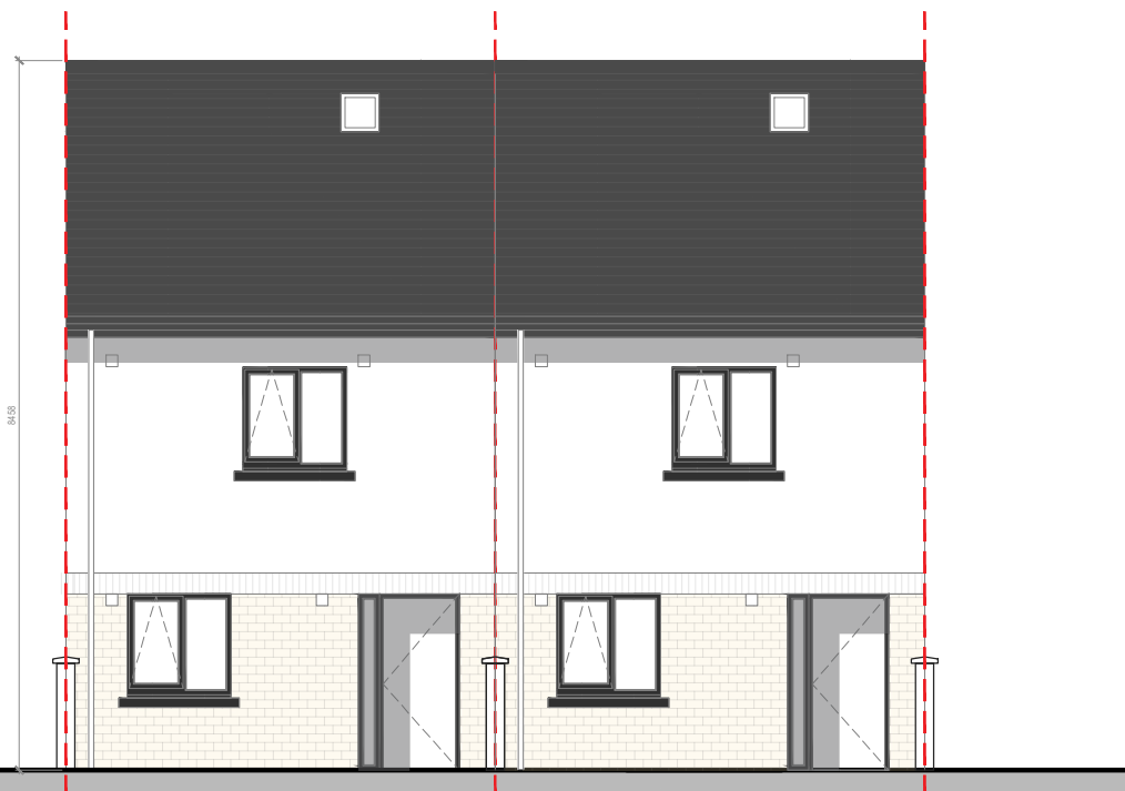
06 FRONT ELEVATION