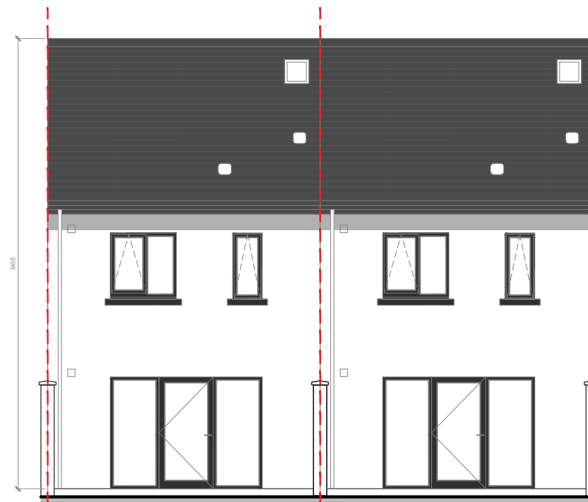
06 REAR ELEVATION